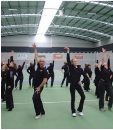
Spectrum strikes its jubilant finale pose while practising off ice in Gore's fantastic sports complex